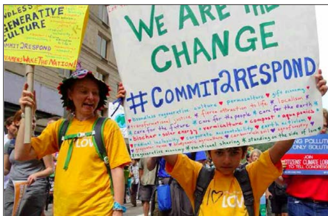
Young climate activist promotes the UU initiative, Commit2Respond.

All in all, I can't imagine how things could have been better. OK, if the UN Secretary General announced the institution of a carbon tax, that would have been better. So, it was near perfect. ♦