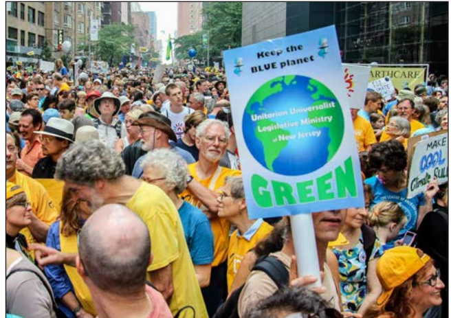
Patently waiting to march with thousands of others in the Interfaith group.

What a phenomenal experience the Climate March was! The official number just came out (9/22) – there were 400,000+ in the march and more than 1,500 of us were UUs. When I