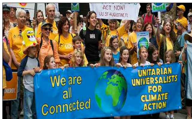
We are all connected – children behind the banner are from First Unitarian Society of Westchester in Hastings, NY.

There were people from all over the country, probably every state. Four hundred buses transported people. There were more people of color than at most environmental events. All ages were there and there were quite a few young people. There were a few people in wheelchairs. You can see photos and videos on various news articles online. Everywhere I could see people were marching.